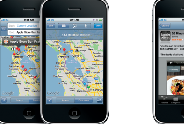
Google, the Google logo, and Google Maps are trademarks of Google Inc. © 2010. All rights reserved.