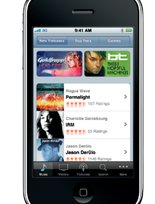
The iTunes Store is available in selected countries

*Visual Voicemail and MMS may not be available in all areas. Please contact your wireless service provider for more information Some features and services are not available in all areas