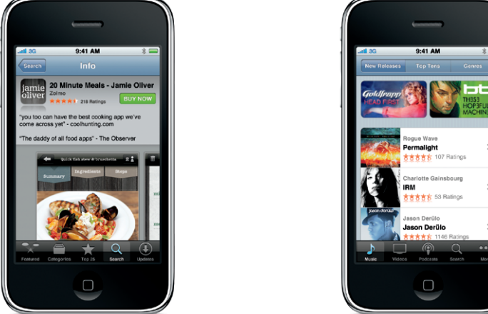
The App Store is available in selected countries.